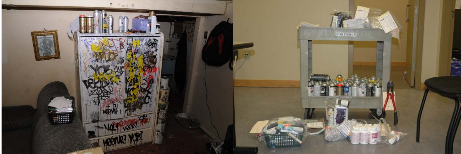
Locker in residence hen arrested